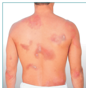
With ENBREL at 3 months (Example of 50% skin clearance)