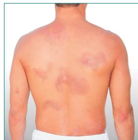
With ENBREL at 6 months (Example of 75% skin clearance)

For illustrative purposes only. Your results may vary.