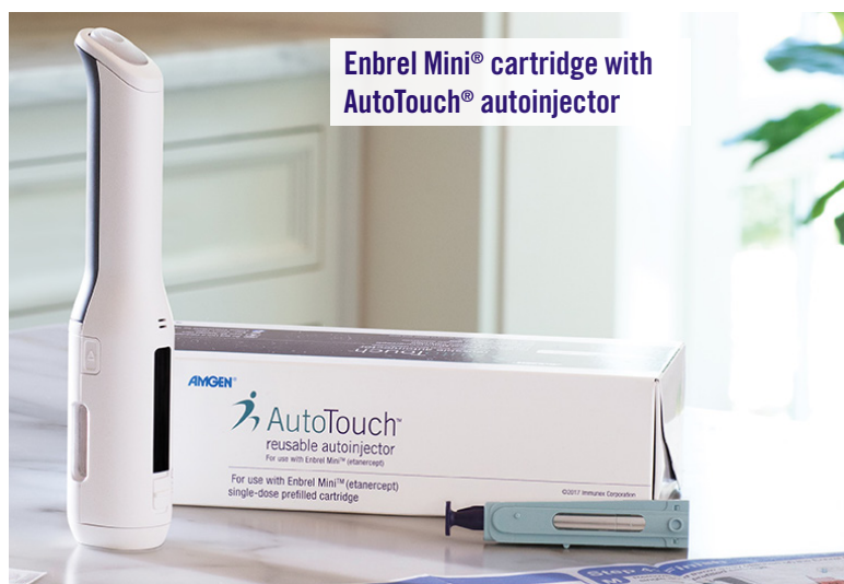
Enbrel Mini® cartridge with AutoTouch® autoinjector

Learn more about all of the injection options ENBREL has to offer on pages 10–13.