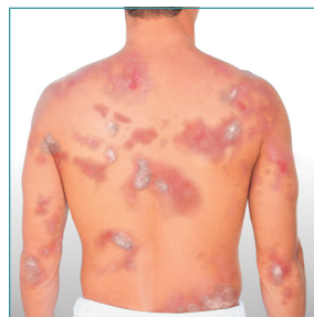
Before ENBREL (Example of moderate to severe PsO)

Although everyone who takes ENBREL responds differently, results through 6 months show ENBREL can help you get clearer skin that lasts.*